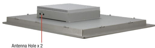
Antenna Hole x 2